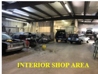
INTERIOR SHOP AREA