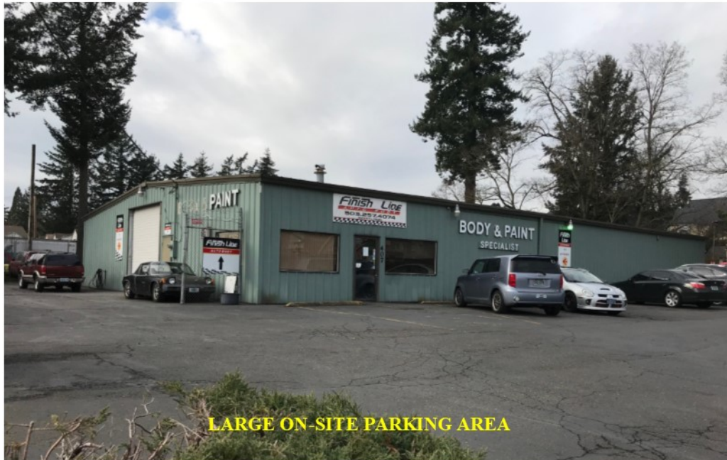
LARGE ON-SITE PARKING AREA