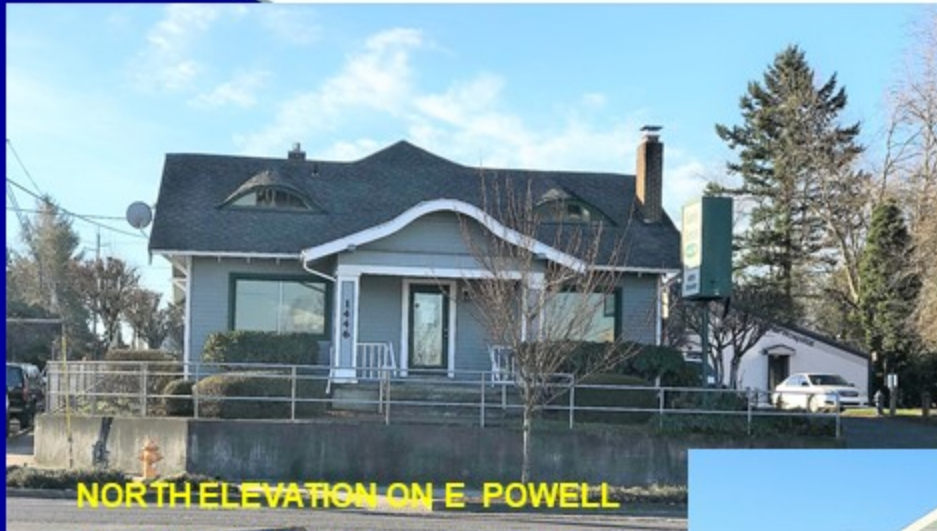
NORTHELEVATION ON E POWELL