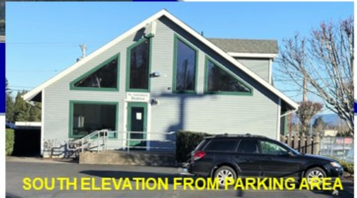
SOUTH ELEVATION FROM PARKING AREA