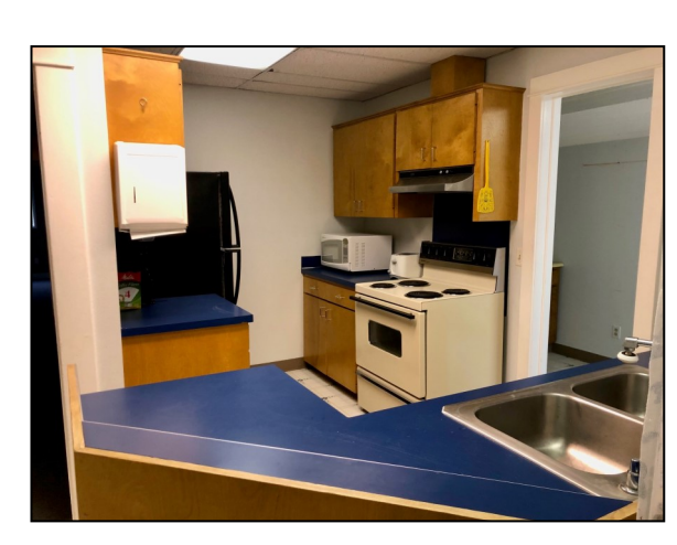
Shared Restroom Shared Kitchen