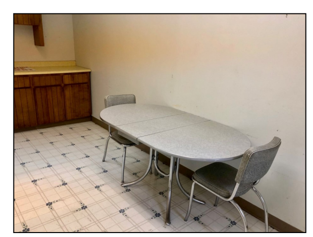
Shared Eating Area