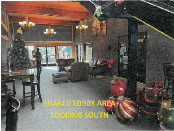
SHARED LOBBY AREA LOOKING SOUTH