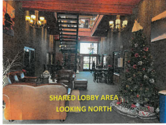
SHARED LOBBY AREA LOOKING NORTH