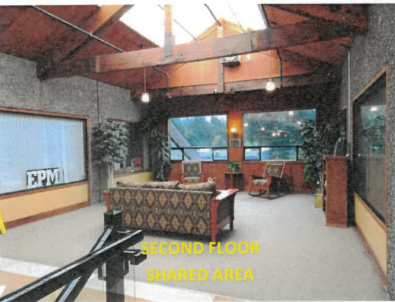
SECOND FLOOR SHARED AREA