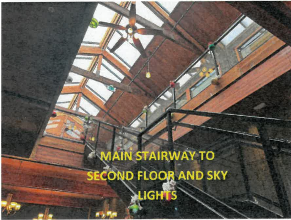
MAIN STAIRWAY TO SECOND FLOOR AND SKY LIGHTS