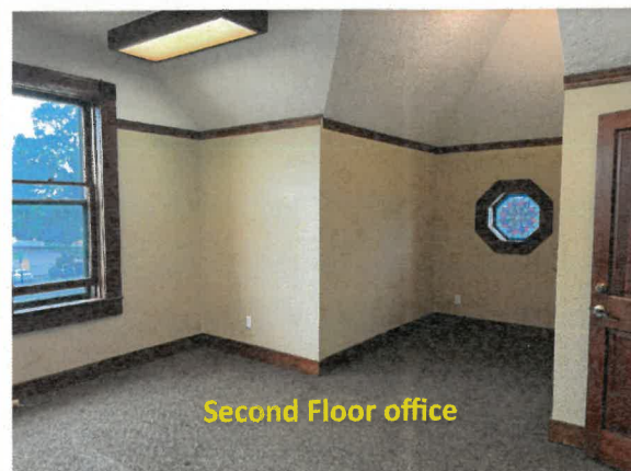
Second Floor office