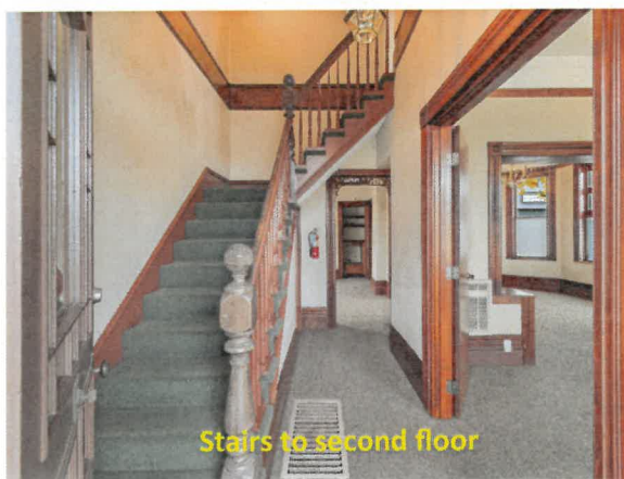
Stairs to second floor